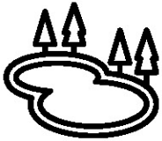
Lake, Beach, or Pond