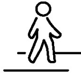
Sidewalk or Trail