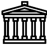
Formal Heritage Property Designation