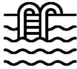
Pool or Splash Pad