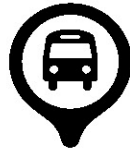
Public Transit Stop