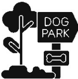
Off-Leash Dog Area