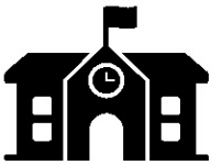
School or Licensed Daycare