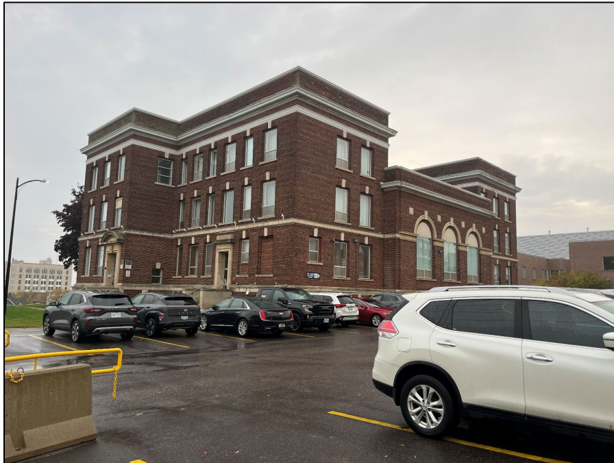
Photograph 6: North and west (rear) elevations of the building (Egis, October 17, 2025).