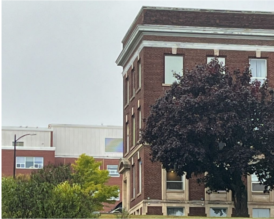
Photograph 5: Close-up of the south elevation from Court Street North (Egis, October 17, 2025).