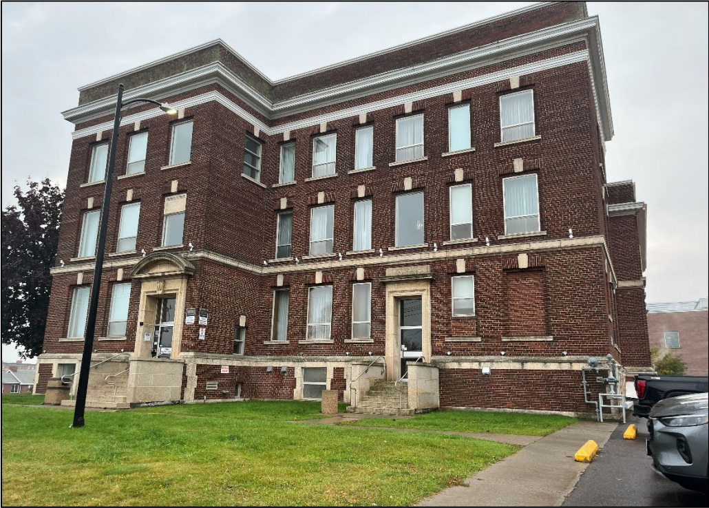
Photograph 4: View of the north elevation showing side entrances including lobby entrance on the south side (Egis, October 17, 2025).