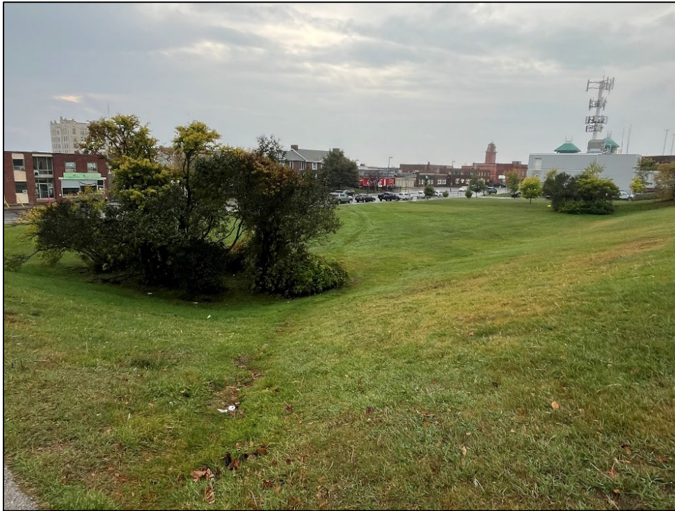
Photograph 7: View looking south across the hill on the property (Egis, October 17, 2025).