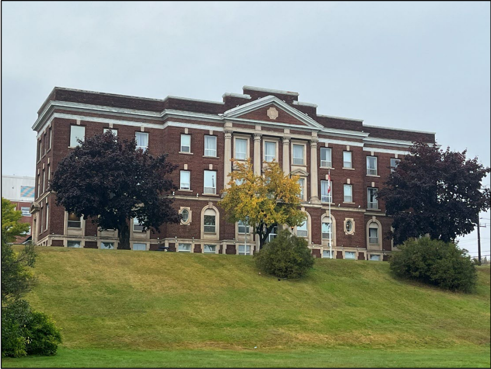
Photograph 2: East elevation of the former Courthouse (Egis, October 17, 2025).