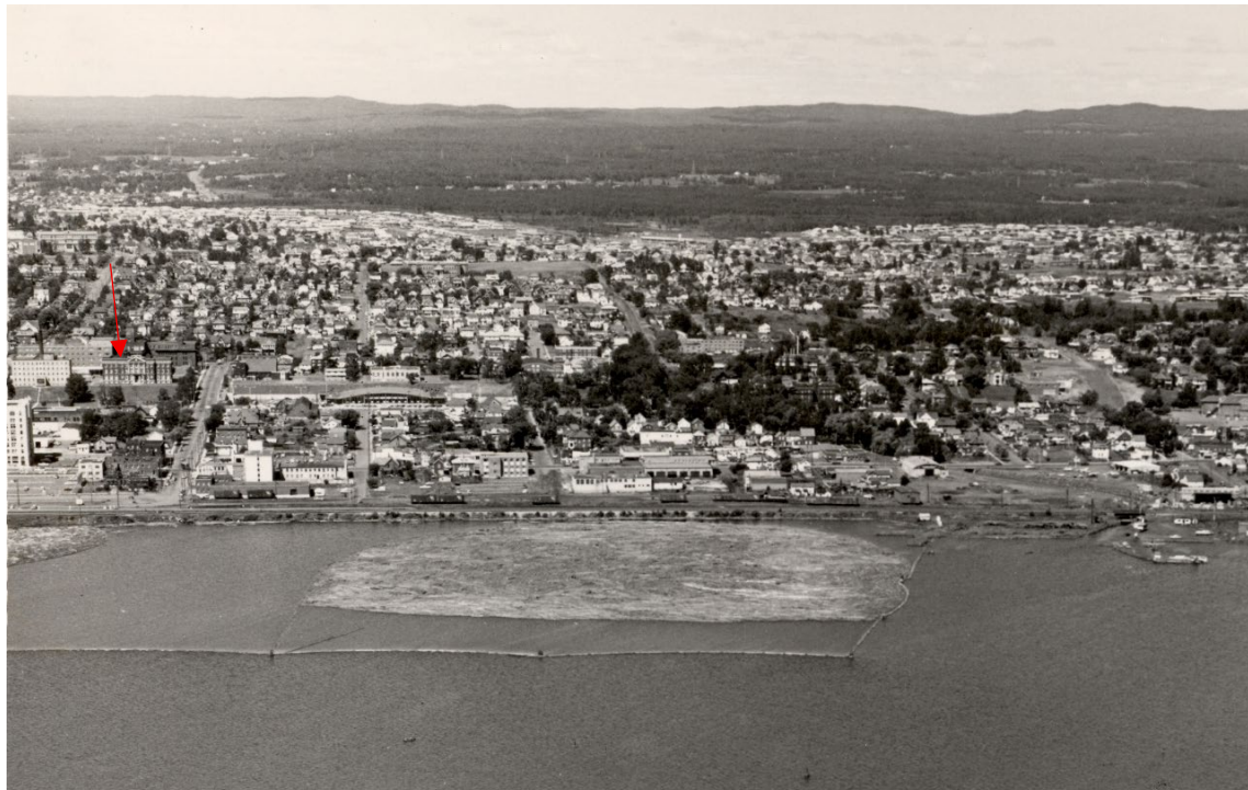
Image 4: ca. 1950s aerial photograph showing Port Arthur from Lake Superior, with the Courthouse prominently visible