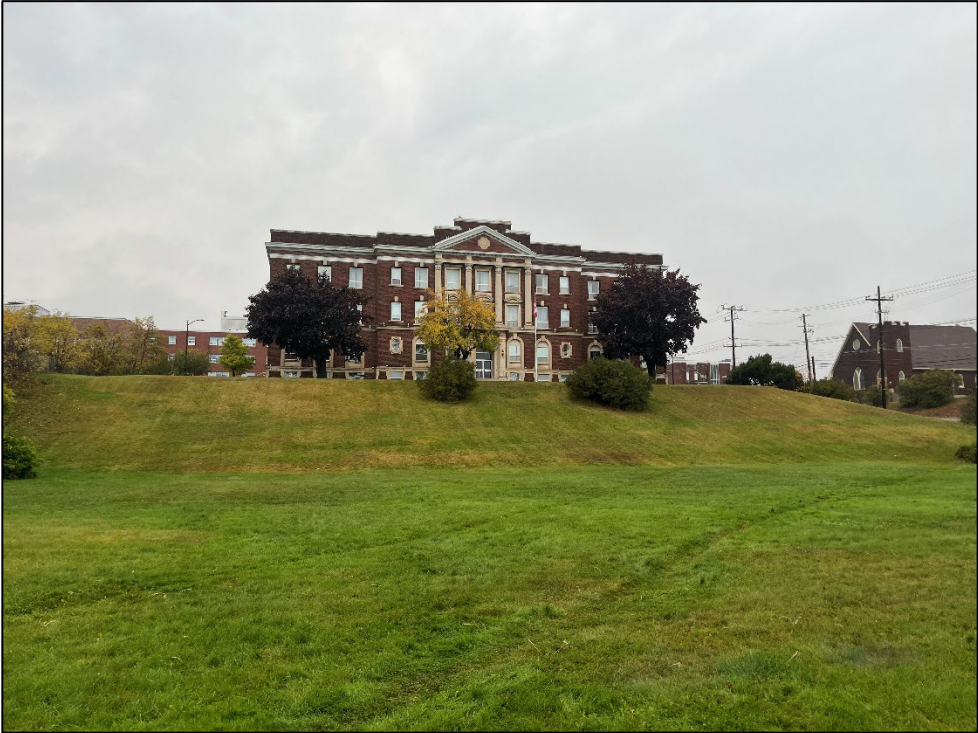
Photograph 1: View of the east elevation of former Courthouse and manicured lawn and graded slope from Court Street North (Egis, October 17, 2025).