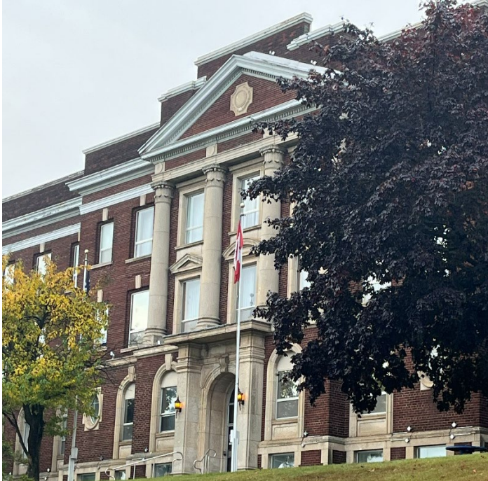
Photograph 3: Close-up of the east elevation (front entrance) of the building (Egis, October 17, 2025).