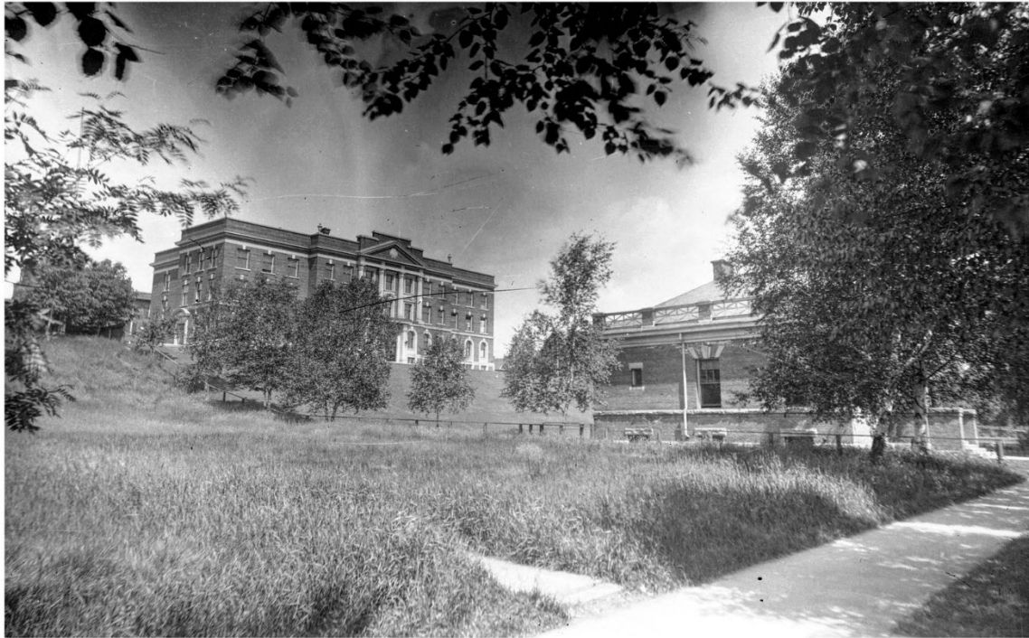
Image 3: Undated photograph showing the Courthouse and former Land Registry Office, believed to have been torn down in the mid-20 th century