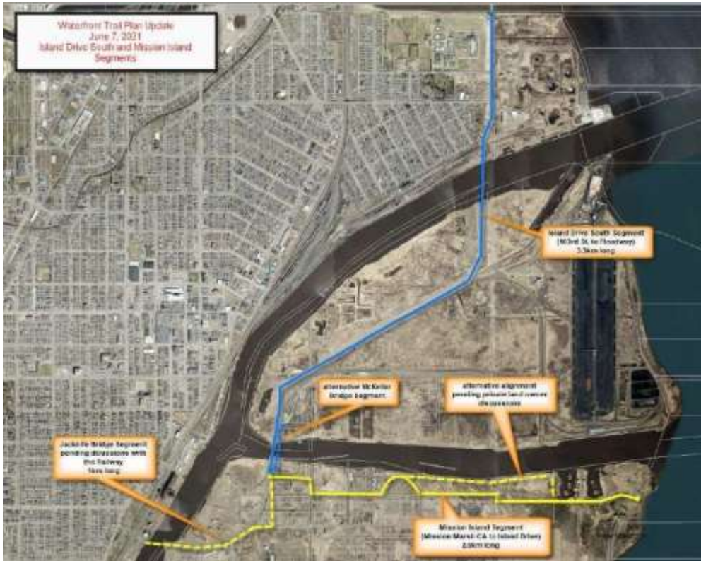
Waterfront Trail Plan Update June 7, 2021 Island Drive South and Mission Island Segments